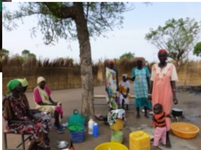
Serving in the Community