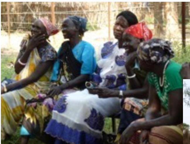
Learning in the community