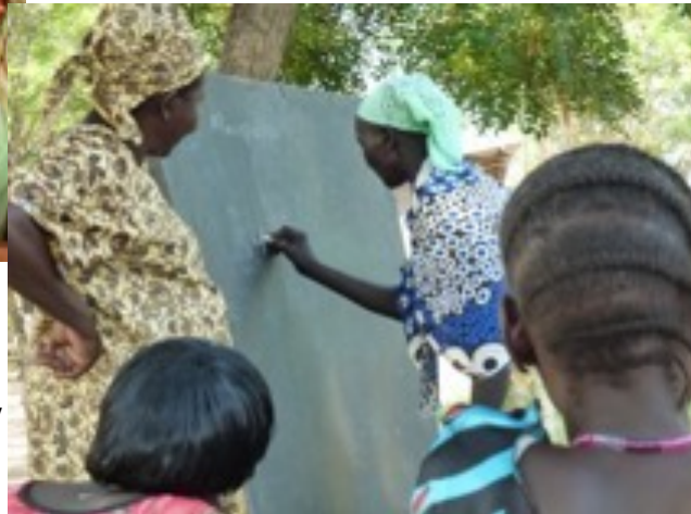
Teaching in the community